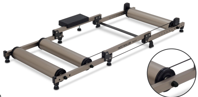
< Roadbike/MTB style > Wheel base size : 1,030mm ver.