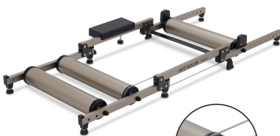
< BMX style > Wheel base size : 775mm ver.